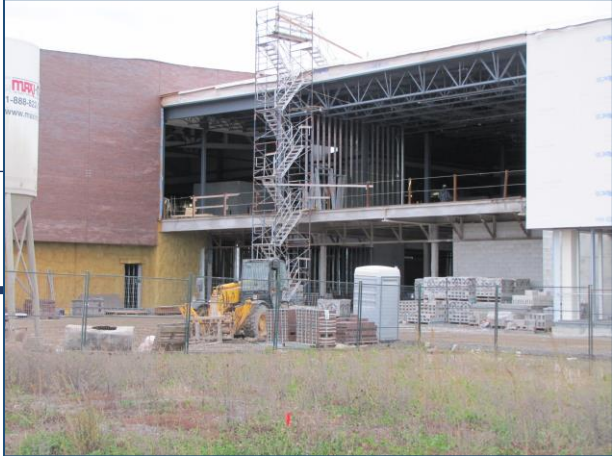
Construction Actual Costs Compared to Budget