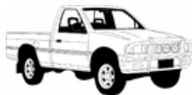
Pick Up Truck